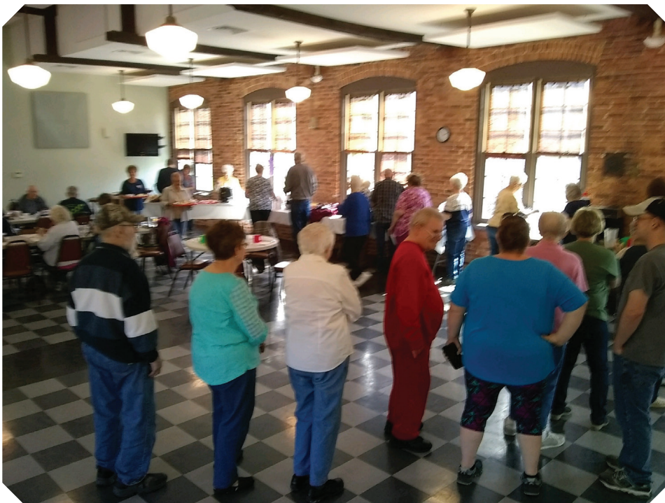
The soup and salad bar

June 24- Summer Safety Speaker at 11:30am