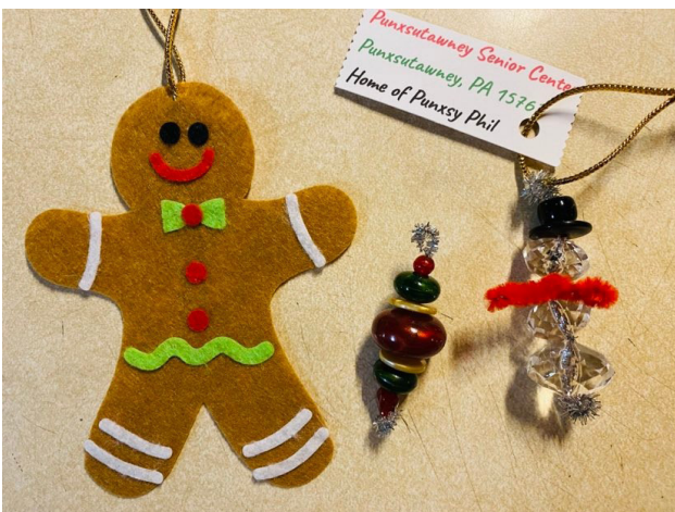
Photo: Folks enjoy making ornaments for the tree in Harrisburg.

Thursday, December 22 – Holiday movie and popcorn – 9:30 to 11